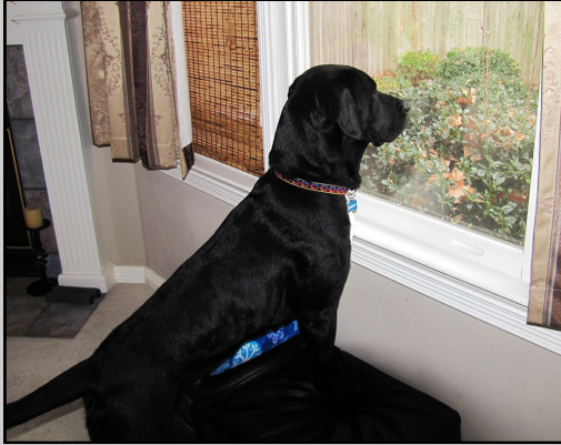
Reebok waiting for the school bus.